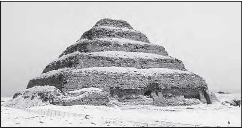
Archaic Period, Dynasties I-III: Step Pyramid, Imhotep, 2650 B.C.E. Cut stone. Saqqara, Egypt.