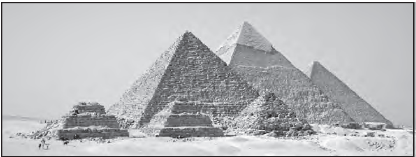
Old Kingdom, Dynasties III-VI: Pyramids of Menkaure, Khafre, and Khufu. Pyramids, of which Khufu's was the largest, were started by him circa 2600 B.C.E. at Giza.